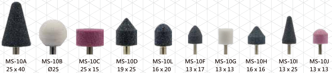
MS-10A 25 x 40 MS-10B Ø25 MS-10C 25 x 15 MS-10D 19 x 25 MS-10L 16 x 20 MS-10F 13 x 17 MS-10G 13 x 13 MS-10H 16 x 16 MS-10I 13 x 25 MS-10J 13 x 13